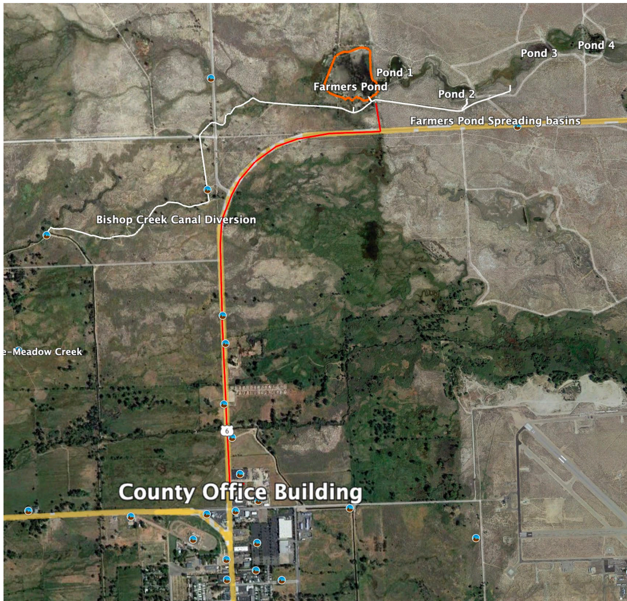
MAP A – County Office Building to Farmer's Pond