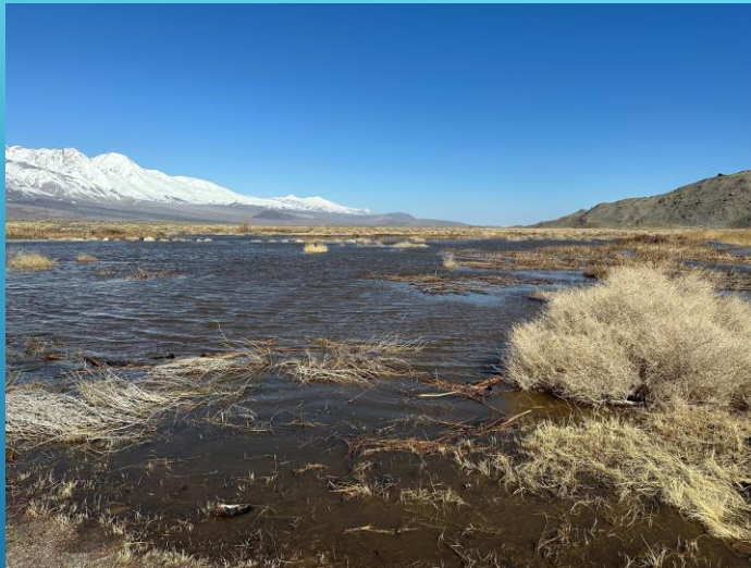
BLACKROCK DITCH LOOKING NORTH – MARCH 16, 2023