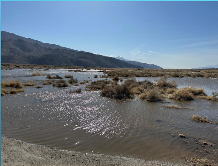
BLACKROCK DITCH LOOKING SOUTH – MARCH 16, 2023