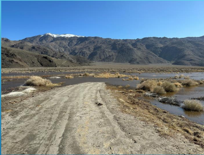
BLACKROCK DITCH LOOKING EAST – MARCH 16, 2023