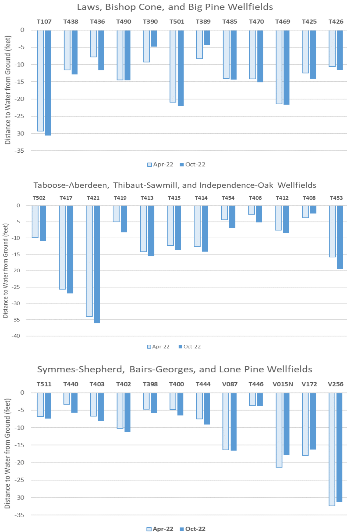
Figure 1 – Groundwater Levels in Owens Valley Monitoring Wells on April 1 and October 1, 2022